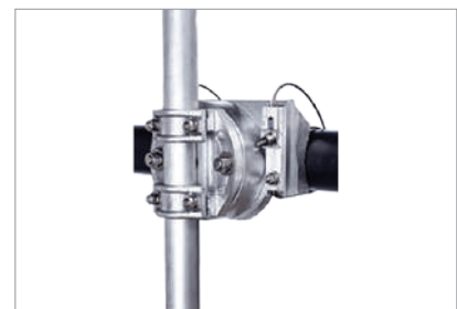
Can-Brac Universal Signal